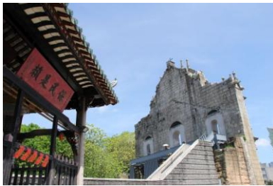
NA TCHA TEMPLE

While most people instantly think of the huge gambling influence that Macao has had on the world, many do not realize that Macau is a city full of history . For those of you who have been to Macau and actually taken in a bit of the Macao culture , you would have noticed the strong European influence across the city, including St Augustine's church and the ruins of St Paul's Cathedral. This is because Macau was the last European territory in continental Asia before it was handed back to China back in 1999. Prior to that, Macau was a colony of Portugal having been so since way back in 1537. The Portuguese influence is still clear but Macau has come into its own since becoming a Special Administrative Region of the People's Republic of China and even more so in recent years.