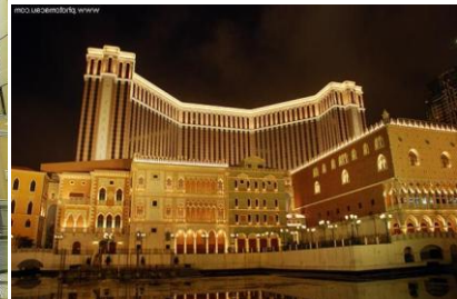
THE VENETIAN MACAO