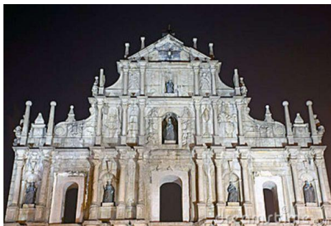
RUINS OF ST. PAUL